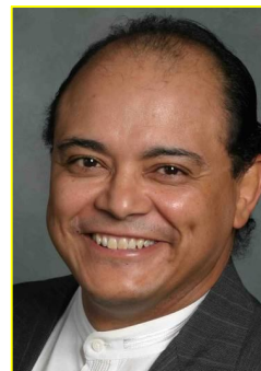
By Angelo Garcia, III Founder, Future Environment Designs, Inc.

common bacteria colonizing 20-40% of the population (meaning that the bacteria is present, but not causing disease) and it has been around since the 1960’s. Approximately 1% of the population is colonized with MRSA. Staph or MRSA are commonly found on the skin or in the nose of healthy people. Staph bacteria is